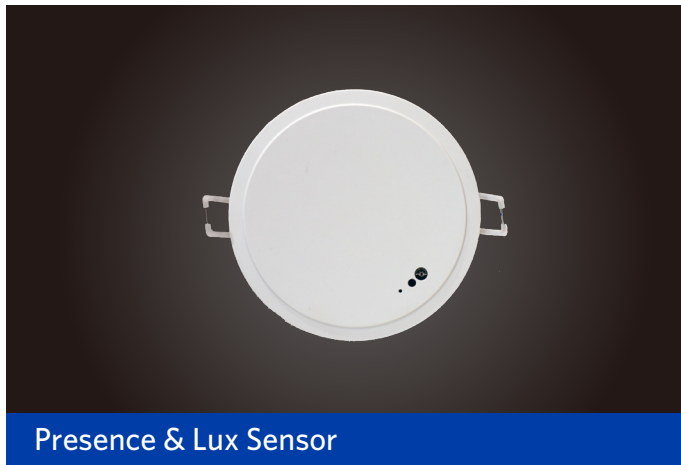
Presence & Lux Sensor